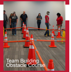
Team Building Obstacle Course